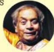
Pt. Birju Maharaj